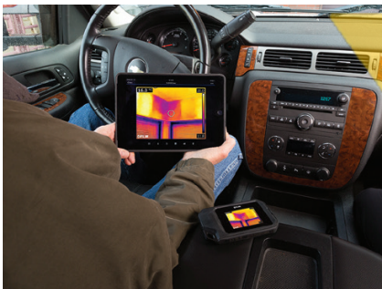
Upload images to FLIR Tools over Wi-Fi