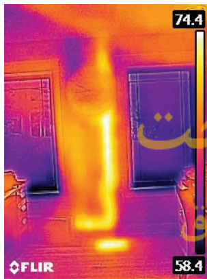
Warm Drain Pipe in Wall